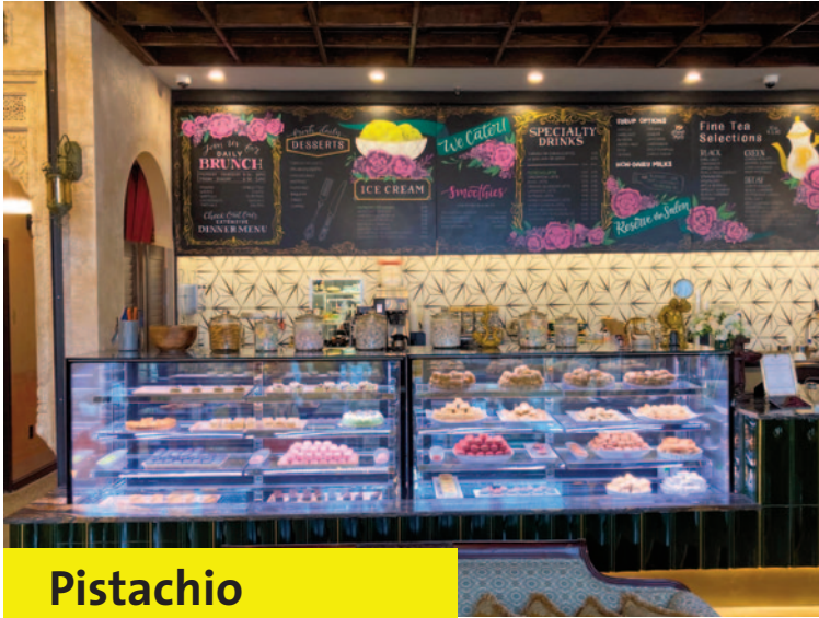
Pistachio Opened December 2022