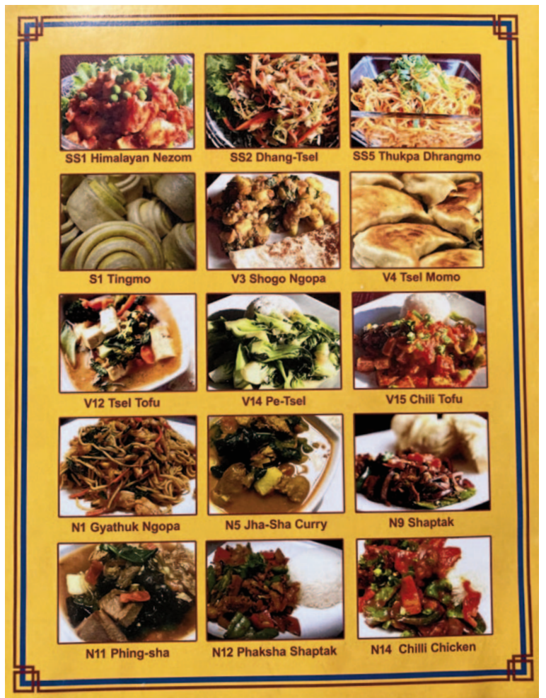
options, it is a fresh new experience that Tibetan and Asian food-lovers as well as other culinary explorers will enjoy.