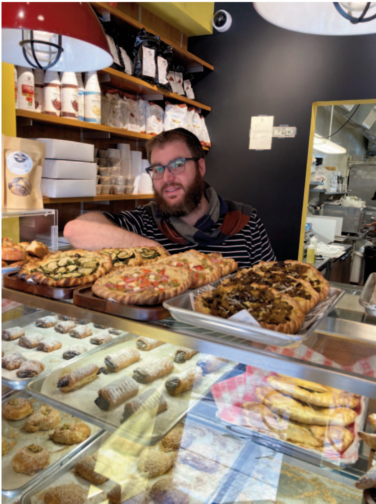
Owned by brothers Jacob Atia and Nadav Adad , Ricotta is New Haven's first kosher pizza restaurant and bakery. It is located at 1203 Chapel Street and offers traditional Ashkenazic baked goods like