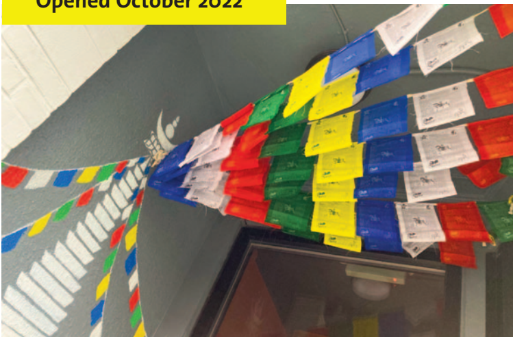
Tibetan Kitchen Opened October 2022