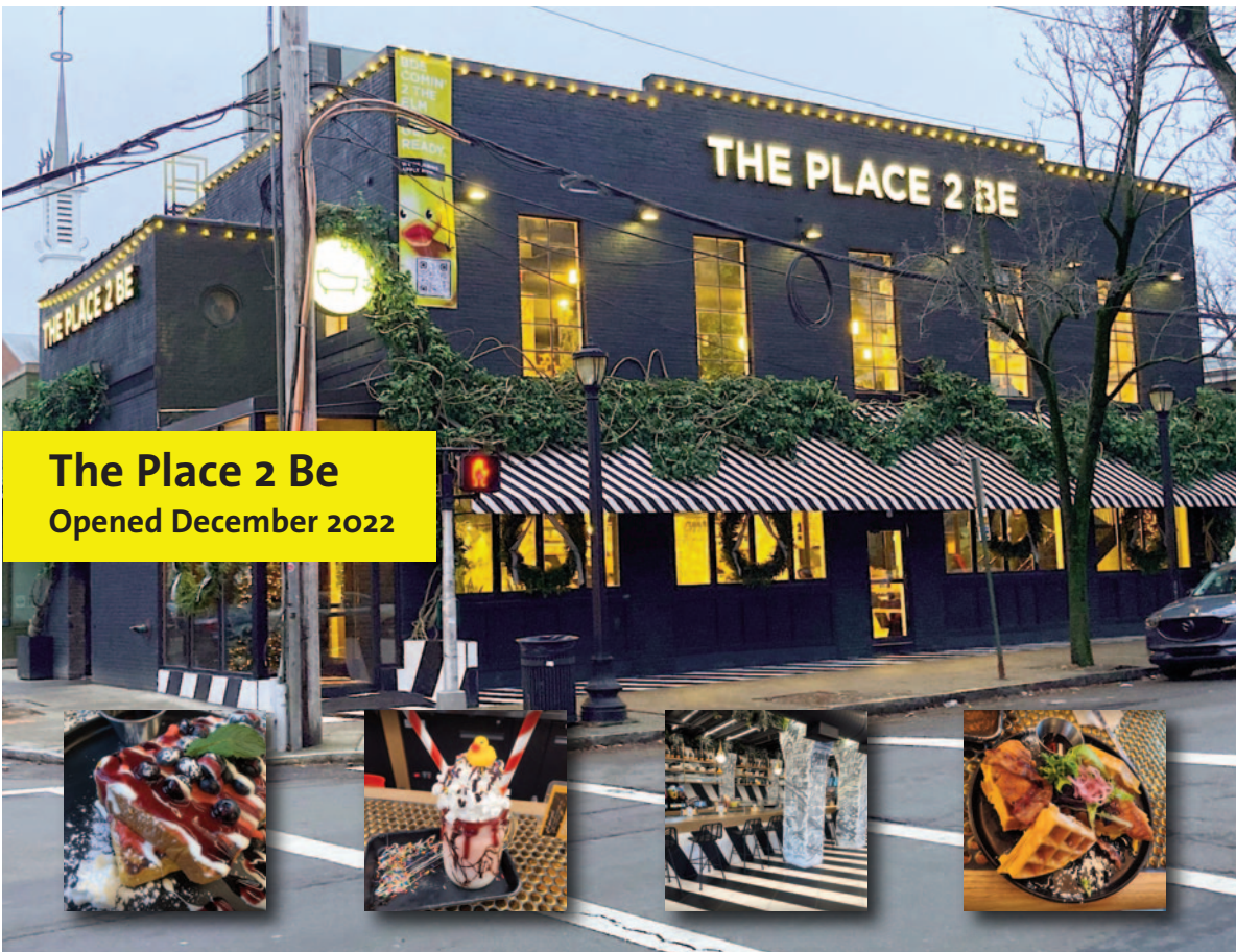
The Place 2 Be Opened December 2022

having a background in art and architecture, has opened this new location with plans for integrating Middle-eastern style and fine dining options into the restaurant's menu.