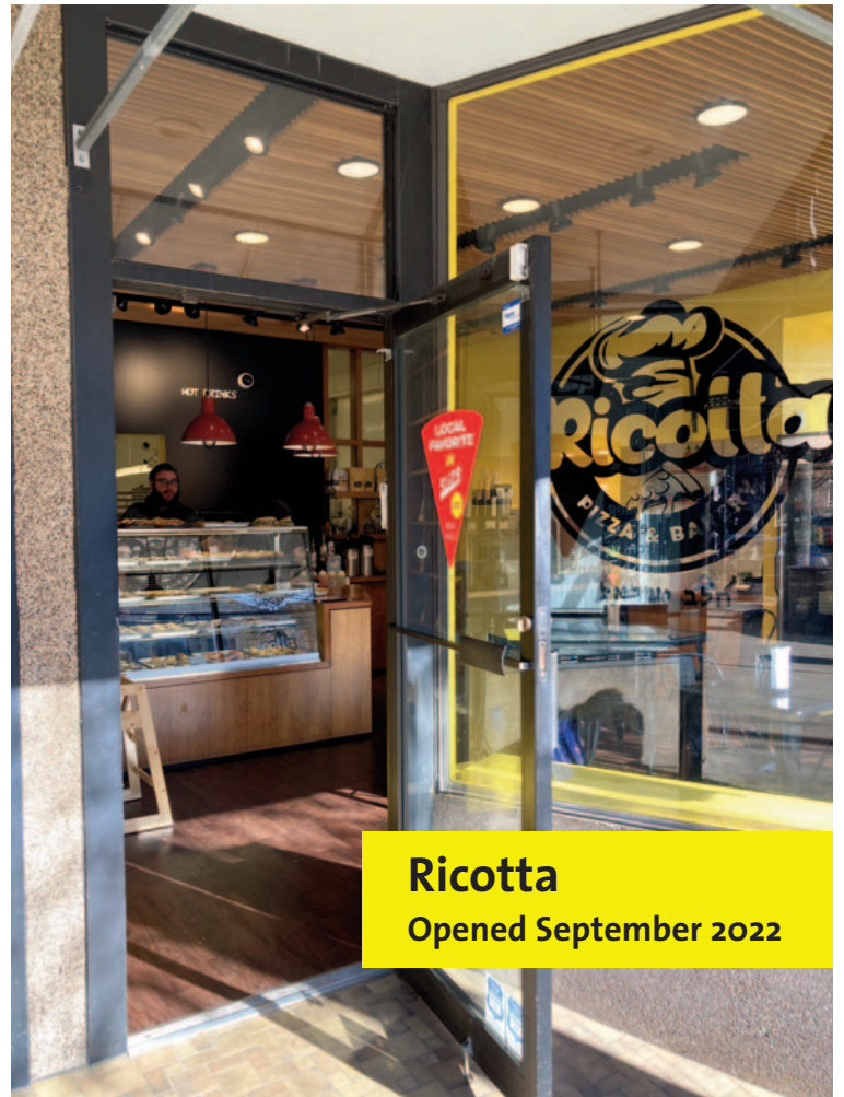
knishes, spinach rolls, and chocolate rugelach, all baked in house, as well as a variety of veggie pizzas. In keeping with the Jewish dietary laws, the restaurant is exclusively all vegetarian.